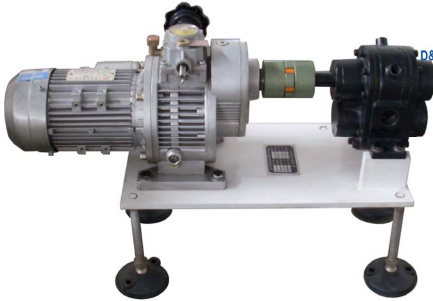
DR-SJB25C chocolate pump