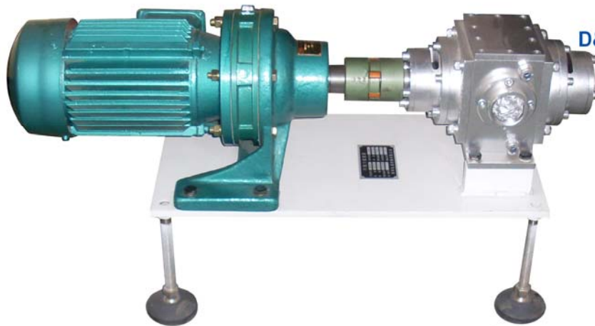
DR-SJB30Y chocolate pump