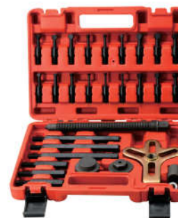
DN-M2007 Blind housing puller kit 滚珠轴承拉马

These special pullers will remove blind housing bearings without the need to dismantle machinery or remove the running shaft. Positive seating allows even tension on inner and outer bearing rings, reducing resistance. Stabilisers reduce sideways movement and self-centre the puller. universal ball bearing puller set is suitable to pull 6005, 6006, 6007, 6008, 6205, 6009, 6010, 6206, 6207, 6208, 6305, 6306, 6209, 6210, 6307, 6308, 6309, 6310 bearings.