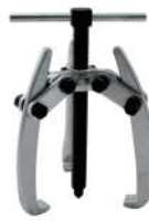
DN-D2016-A mini 3 jaw gear puller 迷你三爪拉马