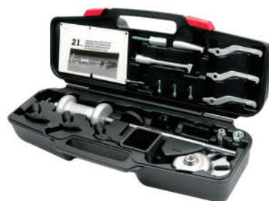
DN-D2006 21pc master Axle Puller Tool Set 21件滑轴拉马套装

Tool set for removing front and rear axle bearings Removes seals from front and rear wheel vehicles Also functions as a slide hammer for dent pulling and gear pulling duty Storage case includes usage photos includes 21-Piece for pulling the master axle.