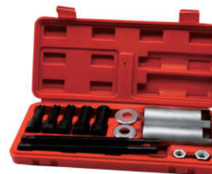
DN-M2009 Motorcycle Internal Bearing Puller Kits 摩托车内轴承拉马

Specification: Specified Bearing Inner Diameter Range: 9mm - 23mm (5 open clamps) For Use In Removing Sleeve Type Bearings From Diameter 0.36" to 0.9" (9mm-23mm) Size: 9mm, 11mm, 14mm, 19mm, 23mm Features: -Heat Treated Steel, Open clamps by turning handle clockwise to snug against the bearing for pulling out evenly without damage the parts* Connect with 1/2" 3/4" male thread water faucet. -Professional Motorcycle Inner Bearing Puller Tool Kit, Ideal for Motorcycle wheel, Pump bearing generator bearing, Machine bearing etc.