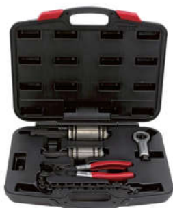
DN-M2001 Exhaust Tool Set 扩张器套装

Tool set for servicing exhaust systems Cuts pipe up to 3-1/2-Inch Use for pipe dent repair and pipe fitting Includes chain cutter, nut splitter and pipe expander Kit 42 includes 4-Piece for servicing exhaust systems.