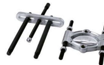
DN-D2011-A Bearing Separator 轴承拉马