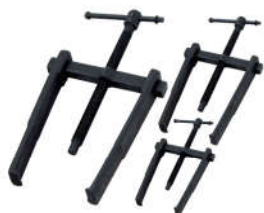
DN-D2004-A 2 jaw gear puller 二爪拉马

Two jaws bearing gear puller installation remover hand tool kit for car. Used to process steel parts which are difficult to make Easy to use: can be rotated from the center of plunger and will soon be able to touch the work center that is pulled.