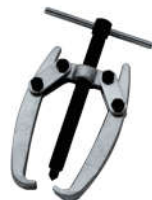
DN-D2015-A Mini 2 jaw gear puller 迷你2爪拉码

Heavy duty twin legged bar type puller, easy removal of pulleys, flywheels, bearings and gears, dropped forged chrome steel heat treated and chrome plated, thrust bearing prevents wear and damage to shaft.