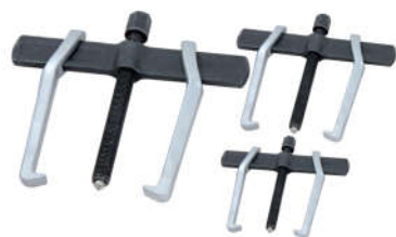
DN-D2003-A 2 jaws Reversible gear pullers 可逆式二爪拉马

Universal puller with two sliding arms drop forged steel, entirely hardened and tempered. Lever action claws fit closely under the part to be removed. The large claw surfaces offer many advantages for careful and quick removal of pulleys, gears, ball bearings etc..