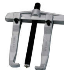
DN-D2014-A 2 jaw gear puller 二爪美式拉马

Heavy duty twin legged bar type puller, easy removal of pulleys, flywheels, bearings and gears, dropped forged chrome steel heat treated and chrome plated. thrust bearing prevents wear and damage to shaft.