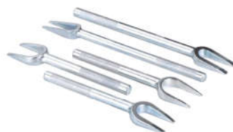
DN-D2010 5pc fork ball joint separator set 5件叉式球头拆卸工具

This kit includes five popular tools used for servicing Pitman arms, ball joints, and tie rods on most vehicles & remove shock linkage. Two Pitman Arm Pullers for large or small ball joint applications. Two Ball Joint Separators. Three different Tie Rod