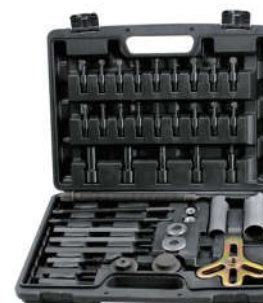
DN-M2013 Blind housing puller kit 滚珠轴承拉马

These special pullers will remove blind housing bearings without the need to dismantle machinery or remove the running shaft. Positive seating allows even tension on inner and outer bearing rings, reducing resistance. Stabilisers reduce sideways movement and self-centre the puller. universal ball bearing puller set is suitable to pull 6005, 6006, 6007, 6008, 6205, 6009, 6010, 6206, 6207, 6208, 6305, 6306, 6209, 6210, 6307, 6308, 6309, 6310 bearings.