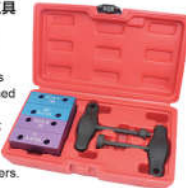
Plate Applications: Purple: 1.4, 1.6, Blue: 1.8, 2.0

Includes six tools for disconnecting spring couplings on Ford, GM, and Chrysler air conditioning lines. Also works on fuel lines and can be used as push lock connectors on radiator and transmission lines.