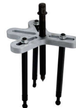
DN-D2008 Blind housing puller kit 滚珠轴承拉马