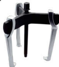
DN-D2005-A 3 jaws Reversible gear pullers 可逆式三爪拉马

Universal puller with two sliding arms drop forged steel, entirely hardened and tempered. Lever action claws fit closely under the part to be removed. The large claw surfaces offer many advantages for careful and quick removal of pulleys, gears, ball bearings etc..