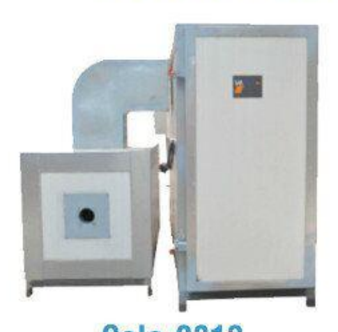
Colo-0813 (Dimension: 0.8m W*1.5m H*3m L)