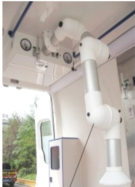
Joints of the duct