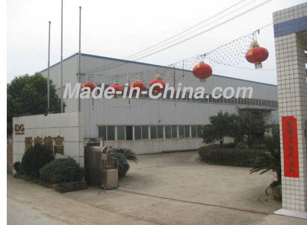
Description: Company Gate