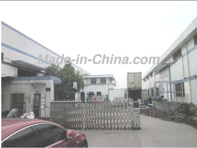
Description: Company Gate