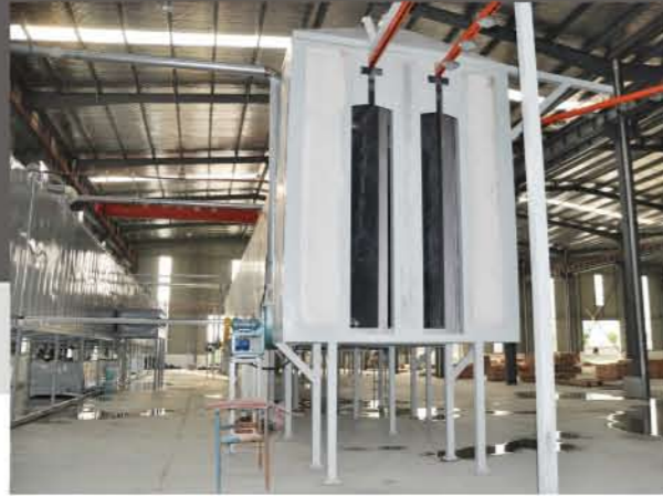
Tunnel curing oven and dry off oven