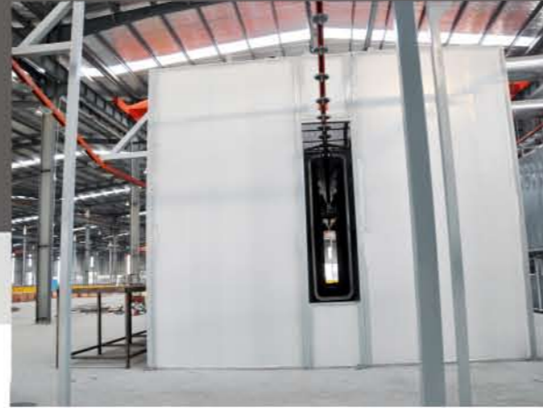
Powder spray booth room