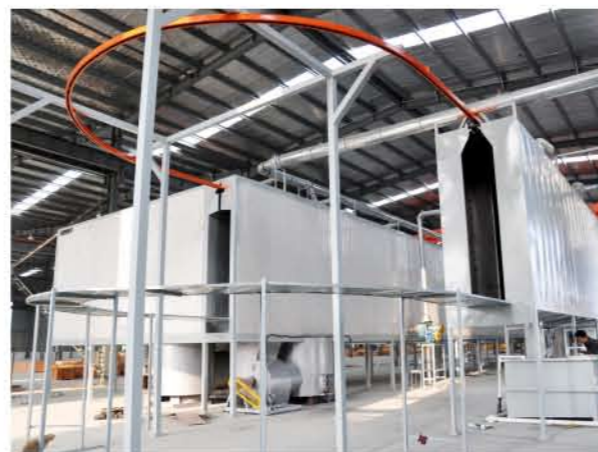
Powder coating line supplied by HI COLO