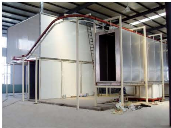
Tunnel curing oven spraying tunnel