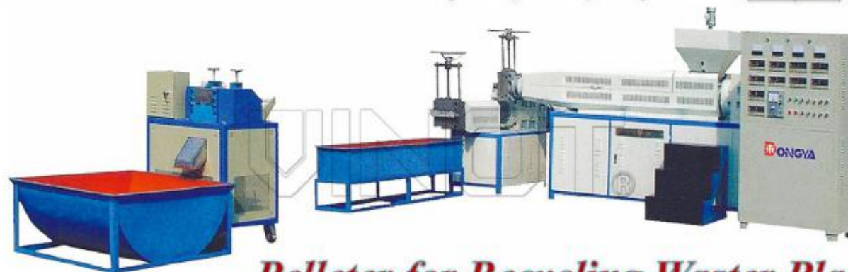
Pelleter for Recycling Waster Plast