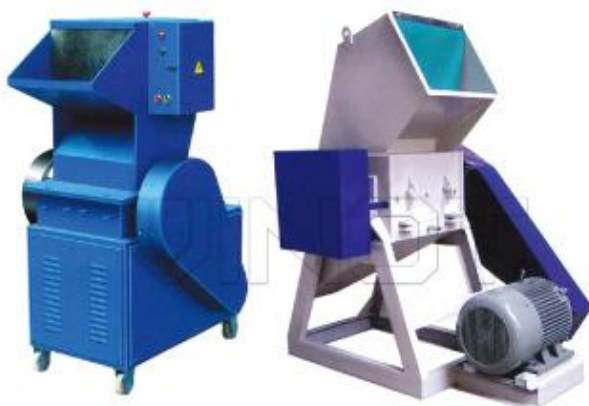
Plastic Crushing Machine