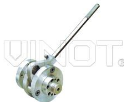
Sigh-Speed Net Changer