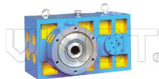
High-strength Hard Tooth Surface Reduction Gearbox