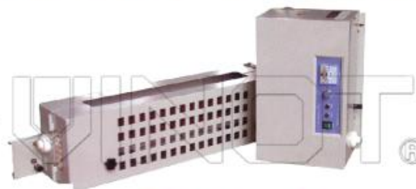
Digital Corona Tranger