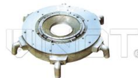
Double Air Vent Ait Ring