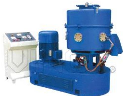
Plastic Grinding Milling Granulator