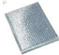
Two Side Seal Kraft Paper Bubble Mailer Making Machine