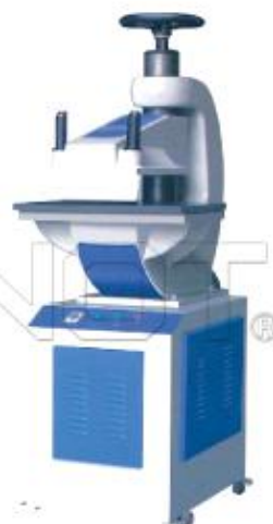
Hydraulic Punching Machine