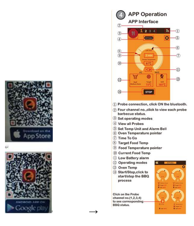
-App operation flow

Bluetooth connection \rightarrow parameter settings \rightarrow select cooking mode (recipe / timer / target) \rightarrow set food type / doneness / time / time / target temperature \rightarrow touch the Start key to start \rightarrow sound and light alarm when cooking end.